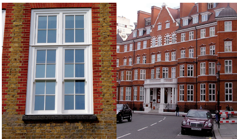
UPM Korkeakoski sawn timber is used in the joinery industry for window frames in the UK.